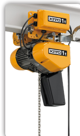
Motorized Trolley Mount