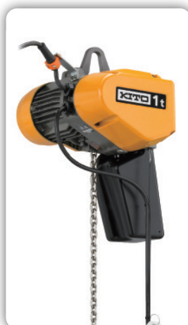
Suspension Bar Mount