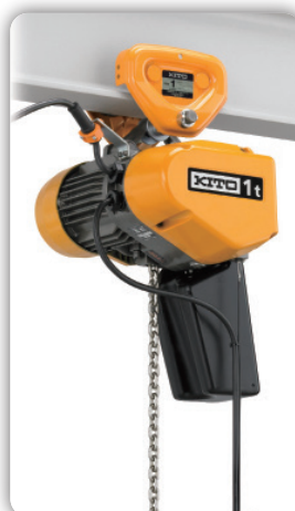
Plain Trolley Mount