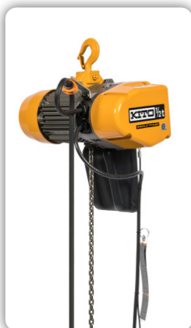
Top Hook Mount