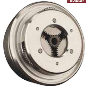
QUICK CLUTCH MECHANISM