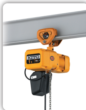
Plain Trolley Mount