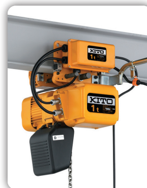
Motorized Trolley Mount