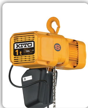
Top Hook Mount