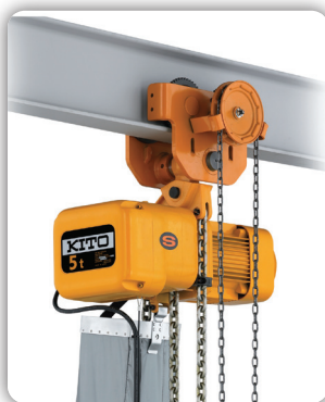
Geared Trolley Mount