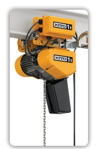
Motorized Trolley Mount