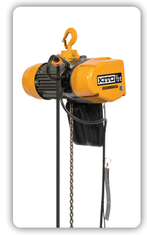
Top Hook Mount