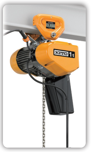
Plain Trolley Mount