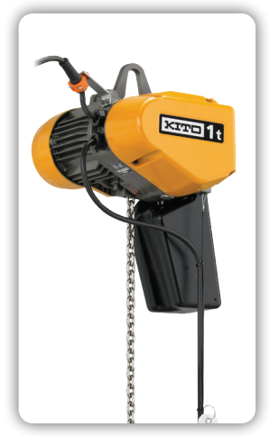
Suspension Bar Mount